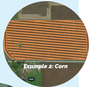
Example 2: Corn