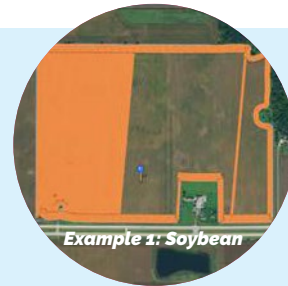
Example 1: Soybean

*If treated acres exceeds 2,500, the farmer works with their local retailer to agree upon a plan for the number of validation fields per crop